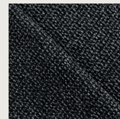
082 Char Coal